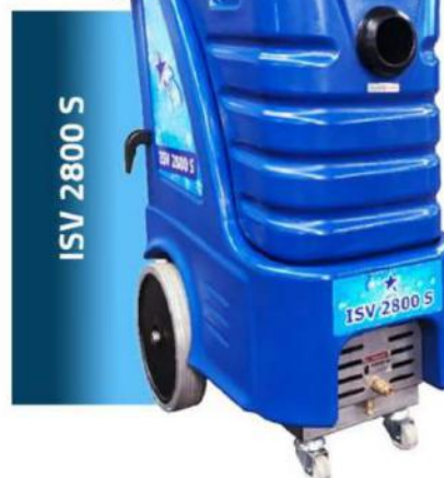
ISV 2800 S